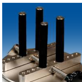
CT005 / CT006 / CT007 Extended length post sets

Complete set of brackets, cable, and hardware for calibration of any Series TT01 torque tester. Weights not available from Mark-10.