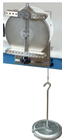
AC1036 Calibration kit

Rubber-edged arms may be independently repositioned to accommodate unique samples.