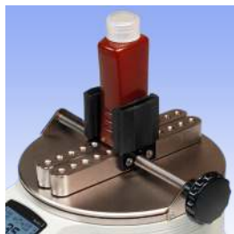
CT001 Flat jaws

Set of rubber jaws for gripping square or odd shaped containers.