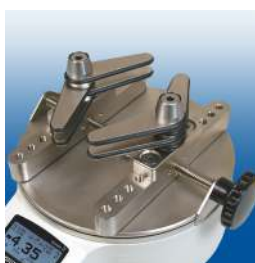
CT003 Adjustable jaws

Provides storage space for the TT01 tester, gripping jaws, AC adapter, and accessories.