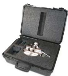
CT002 Carrying case

Set of rubber jaws for gripping square or odd shaped containers.