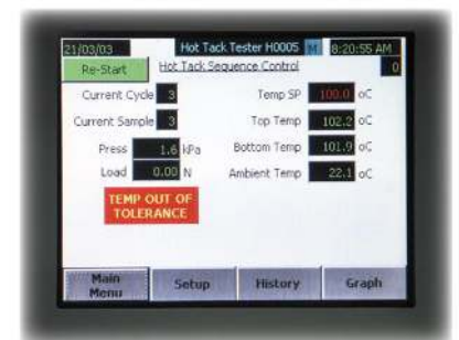
Touch Screen Operation