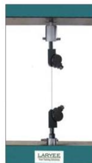
Thread Tension 1