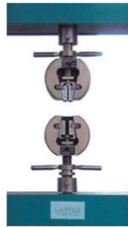
Wedge Tension 2