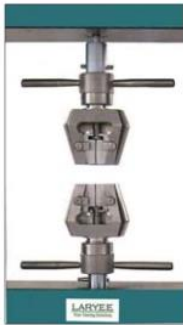
Wedge Tension 1