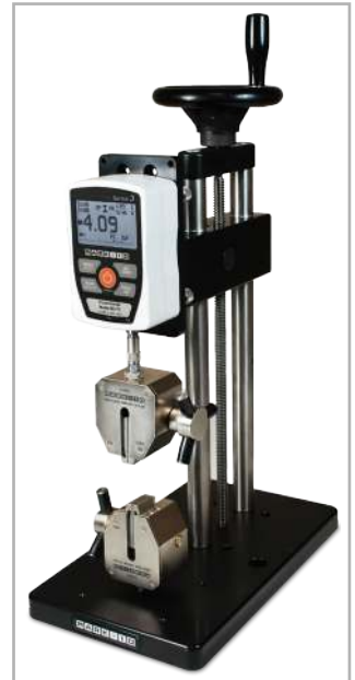
Shown with an ES20 test stand and G1061 wedge grips

An ergonomic, reversible aluminum housing allows for hand held use or test stand mounting for more sophisticated testing requirements. Series 3 digital force gauges are directly compatible with Mark-10 test stands, grips, and software.