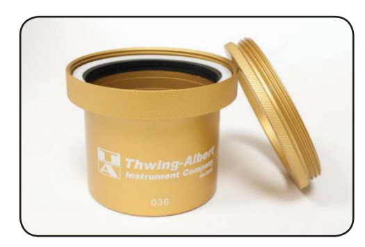
Model 68-3000 EZ-Cup

Easy open model simply turn to open and close the sample in place with the threaded flanged ring.