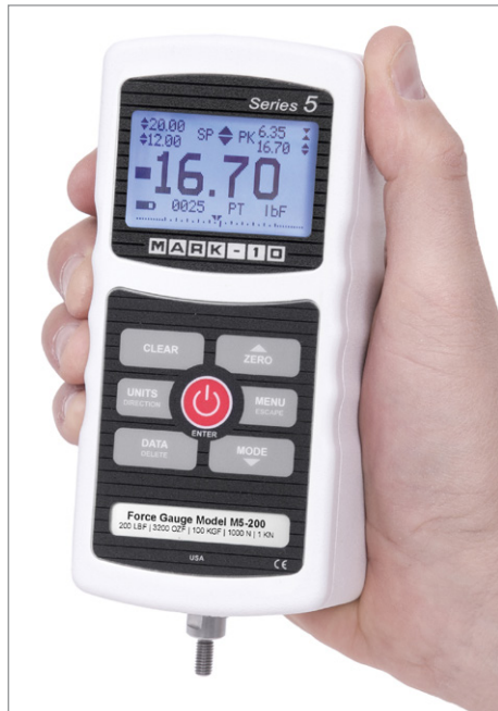
Force gauge displays real time force reading, peak force, and pass/fail indicators. The load cell shaft may be oriented in the up or down position, as demonstrated in the images below.