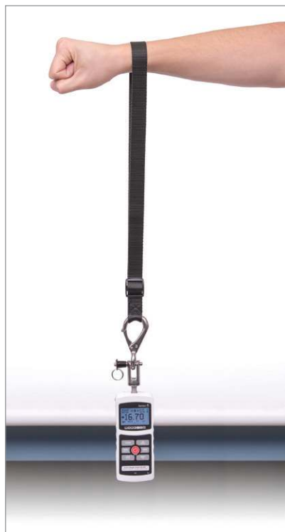
Force gauge shown in a vertical orientation

The Model EKM5-200 Myometer Kit facilitates a wide range of strength assessments and ergonomics studies. Featuring a Series 5 force gauge with 200 lbF (1,000 N) range, tabletop mount, strap, and accessories, this kit is ideal for ergonomists and other professionals.