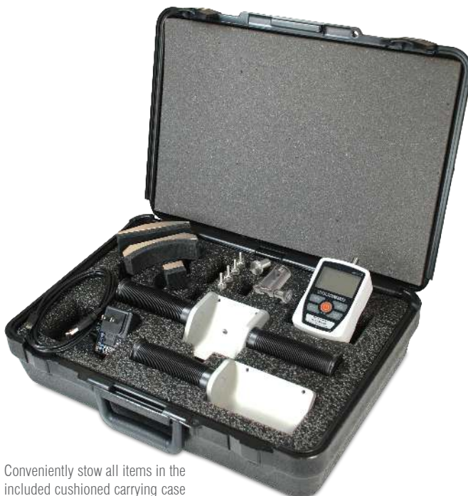
Conveniently stow all items in the included cushioned carrying case