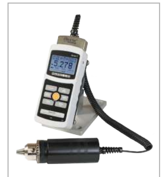
7i is shown mounted to an optional AC1008 tabletop stand with Series R50 torque sensor

The 7i interfaces with Mark-10 test stands to permit functions such as break testing, dynamic load holding, PC control capability, and more. The included MESUR™ Lite data acquisition software tabulates continuous or single point data. Data saved in the indicator's memory can also be downloaded in bulk. One-click export to Excel easily allows for further data manipulation.