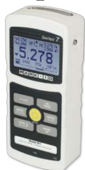
Model 7i Professional Indicator