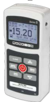
Model 5i Advanced Indicator