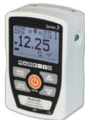
Model 3i Basic Indicator