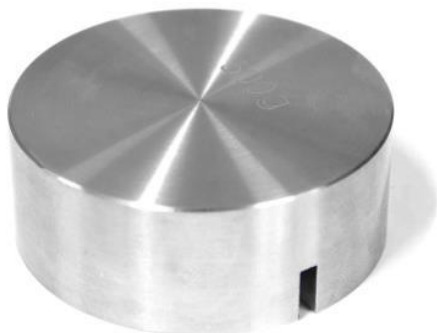
500 g Calibration weight provided