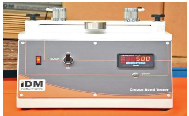
Checking Calibration with 500g weight