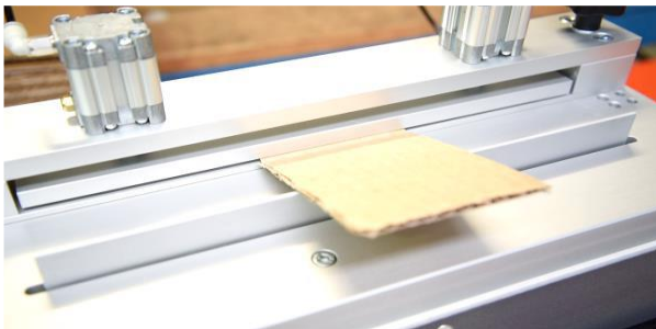
Crease Bending – against grain