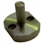
Cutting Die Adaptor