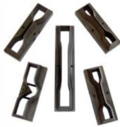
Tool Steel Cutting Dies (IDM-C0024-M1)