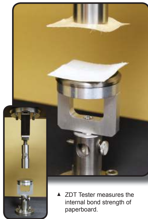
▲ ZDT Tester measures the internal bond strength of paperboard.