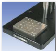
Base plate AC1060 Contains 25 #10-32 threaded holes for fixture mounting