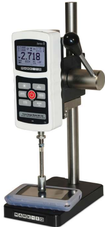
The ES05 is shown in a switch contact activation test, with Series 5 digital force gauge, extension rod and rubber tip attachment.