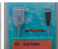
USB - R232 adapter