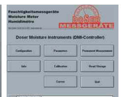
PC software DMI-Controller