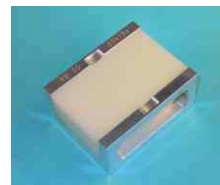
test module PE05