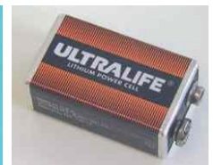
lithium long life bat., 30h measuring time