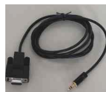
serial interface cable (RS232)