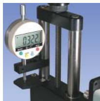
Digital travel indicator