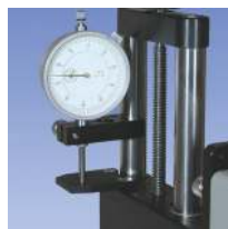
Dial travel indicator