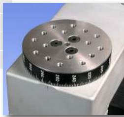
^ Rotating torque plate includes a matrix of tapped holes for grip or fixture mounting

* Maximum torque decreases proportionately with speed. Examples: - Maximum torque at 60 RPM = 25 lbFin [2.8 Nm] - Maximum torque at 30 RPM = 50 lbFin [5.6 Nm]