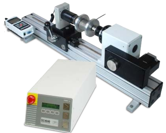
^ The TSTMH-DC is shown in a torsion spring test, with a Series R50 torque sensor and M5i force/torque indicator