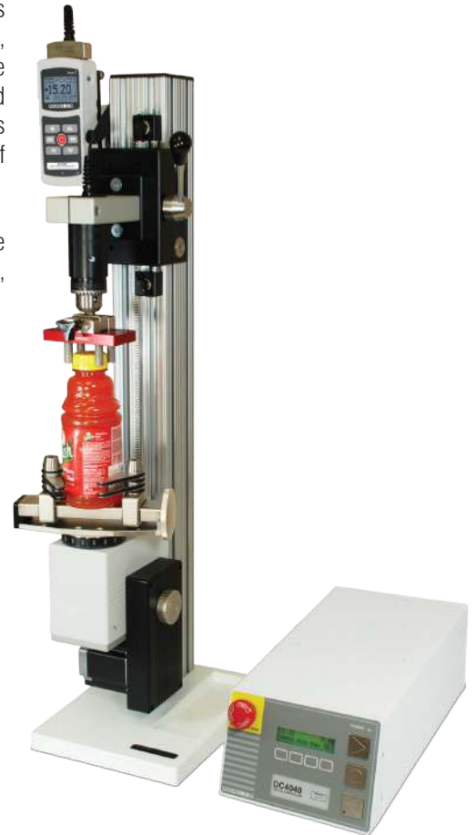
^ The TSTM-DC is shown in a cap torque test, with a Series R50 torque sensor, M5i force/torque indicator, G1023 universal closure grip, and G1053 cap grip