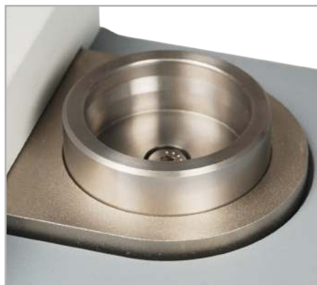
WT3003 Machinable blank terminal fixture For unique sample shapes and sizes.