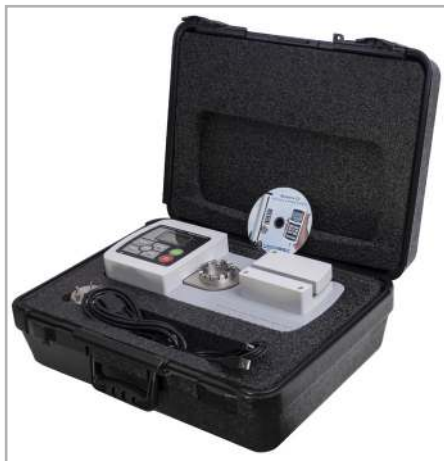
WT3004 Carrying case Provides storage space for the WT3-201M tester, optional ring terminal fixture, power cord, USB cable, and accessories.