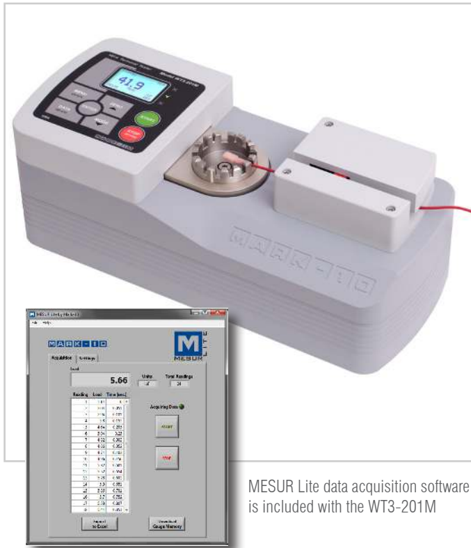
MESUR Lite data acquisition software is included with the WT3-201M

The WT3-201M motorized wire crimp pull tester is designed to measure pull-off forces of up to 200 lbF [1 kN] for wire and tube terminations. The tester conforms to numerous UL, ISO, ASTM, SAE, MIL, and other requirements for destructive testing. Non-destructive testing is also possible, such as pulling to a load or maintaining a load for a specified period of time, as per the requirements of UL 486A/B. Programmable pass/fail limits with red and green indicators and audio alerts help identify non-conforming samples.