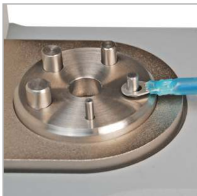
WT3002 Ring terminal fixture Secures ring terminations. Pin diameters from 1/8 to 3/8 in [3.2 to 9.5 mm].