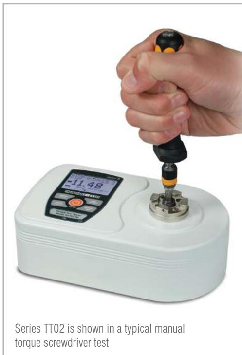
Series TT02 is shown in a typical manual torque screwdriver test

Series TT02 Torque Tool Testers present a simple and accurate solution for testing manual, electric, and pneumatic torque screwdrivers, wrenches, and other tools. These testers are compact and rugged, suitable for production environments. A universal 3/8" square receptacle accepts common bits and attachments. The TT02 captures peak torque in both measurement directions, and also calculates 1st and 2nd peaks, useful for click-type tools.