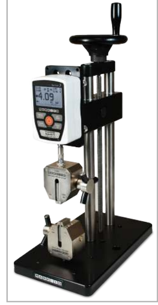
Shown with an ES20 test stand and G1061 wedge grips

with Mark-10 test stands, grips, and software.