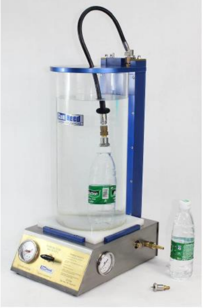
PET bottled beverage (Without gas)