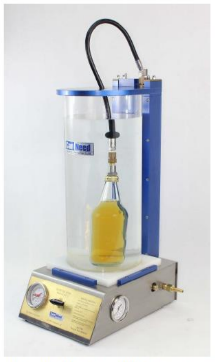
Bottle Can-crown cap