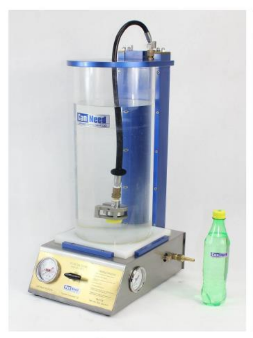
PET bottled beverage (With gas)