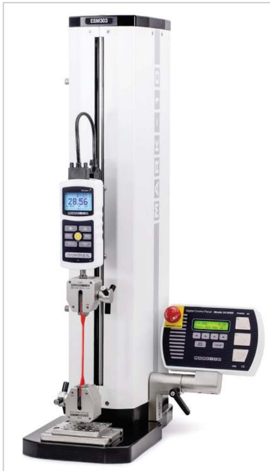
^ ESM303 is shown above configured for a tensile test, with a Series 7 force gauge and G1061-2 wedge grips.

The ESM303 is a highly configurable single-column force tester for tension and compression measurement applications up to 300 lbf [1.5 kN], with a rugged design suitable for laboratory and production environments. Sample setup and fine positioning are a breeze with available FollowMe™ force-based positioning - using your hand as your guide, push and pull on the force gauge or load cell to move the crosshead at a variable rate of speed.