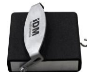
C0055-SP6: COF Sled 200g