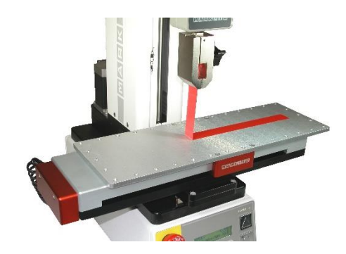
90-degree peel Attachment

The purpose of this test is to compare the adhesive response of different laminates. Measuring peel adhesion at 90° normally gives a lower value than at 180° and allows values to be measured for materials normally giving paper tear. Adhesion is measured 20 minutes and 24 hours after application, the latter being considered as the ultimate adhesion. Test strips should be 25 mm wide and have a minimum length of 175 mm in the machine direction.