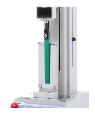
180-degree peel Attachment

FTM 3 is used to determine the force required to separate the release backing from the pressure sensitive adhesive coated face material. The test procedure includes fixing each strip by double sided tape (cover the full test area of the sample), so the laminate can be peeled apart at an angle of 180°. The Tester has a low speed feature to perform this test.