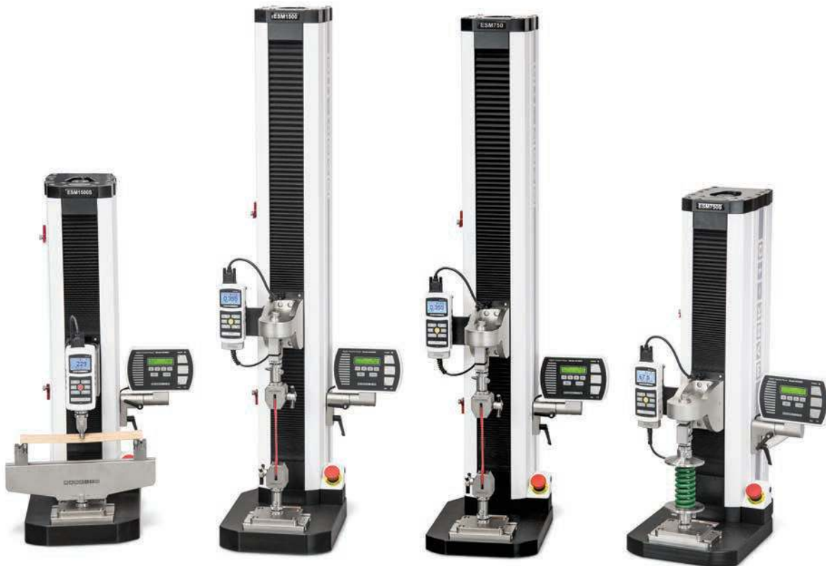
ESM1500S 1,500 lbF [6.7 kN] 14.2 in [360 mm] travel