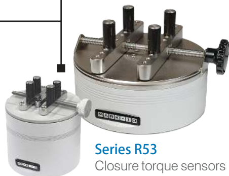
Series R53 Closure torque sensors