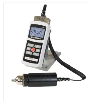
5i is shown mounted to an optional AC1008 tabletop stand with Series R50 torque sensor

The 5i includes MESUR™ Lite data acquisition software. MESUR™ Lite tabulates continuous or single point data. Data saved in the indicator's memory can also be downloaded in bulk. One-click export to Excel easily allows for further data manipulation.