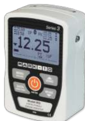
Model 3i Basic Indicator