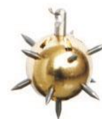
Gold Plated Steel Ball