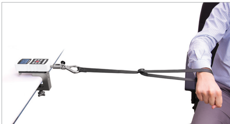
Force gauge shown in a horizontal orientation