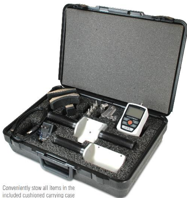
Conveniently stow all items in the included cushioned carrying case