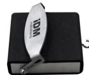
C0055-SP6: COF Sled 200g