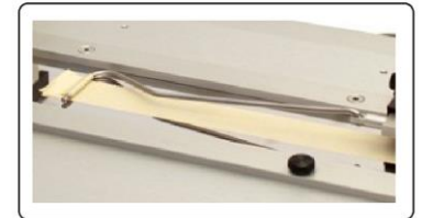
C0055-OP2: 180° Peel Fixture