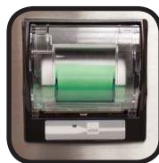
Printer with Sample Data

The Inkometer 1100 multi-line display shows the temperature, tack, roller speed and test time. Tack readings can be exported to the RS-232 port, the integrated printer or to a USB flash drive. Statistical reports can be viewed directly from the display. The Inkometer provides four test methods based on ASTM D-4361 as well as five user configurable methods that are stored in non-volatile memory.