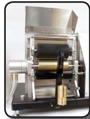
▲ Calibration Weights in Place Included with Package