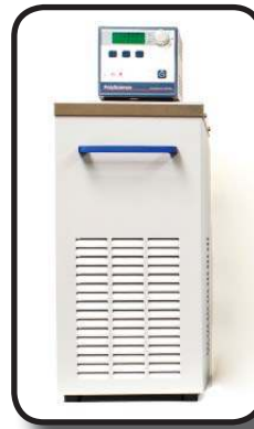
▲ Constant Temperature Circulator (CTC)

Approx. Gross Weight: 300 lbs (136.08 kg) including CTC