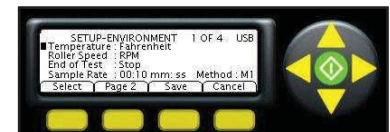
◀ Sample Menu Setups